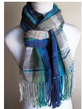
Royal Blue Rendezvous Samantha Haring