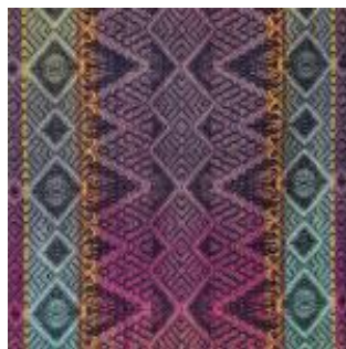
Kaleidoscope — Carol Wooten