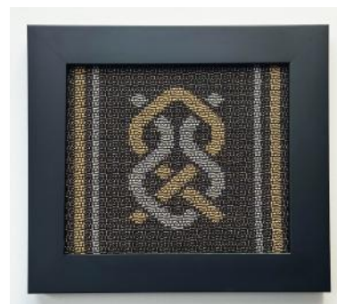
Ties that Bind