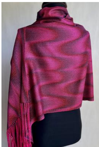
Be Still (my beating heart)