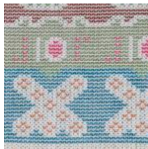
Celebration of Ten by Carla Gladstone

To view Complexity 2024 online, go to https://complexityexhibition.org/