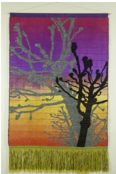
Spring Promises Suzy Furness

Your Journal staff, all volunteers, are ready and eager to help you with your contribution.