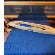
Complexity Sample Idea