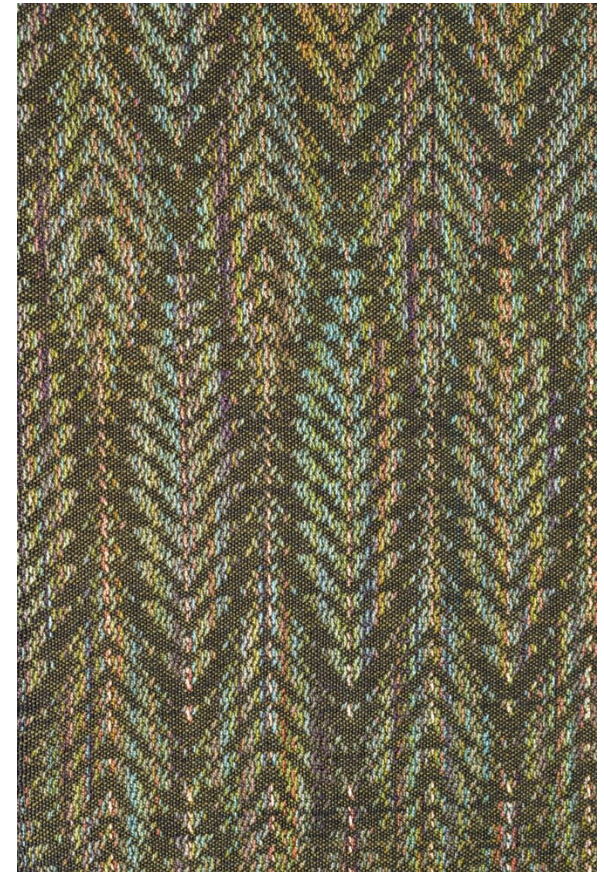
Black Feathers (detail) by Karen Donde

Bettes Silver-Schack cwcomplexity2020@gmail.com