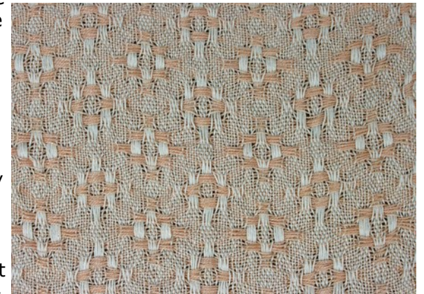
Stacey Harvey-Brown (detail)

Bookmarks will be re-printed for distribution at regional weaving conferences.