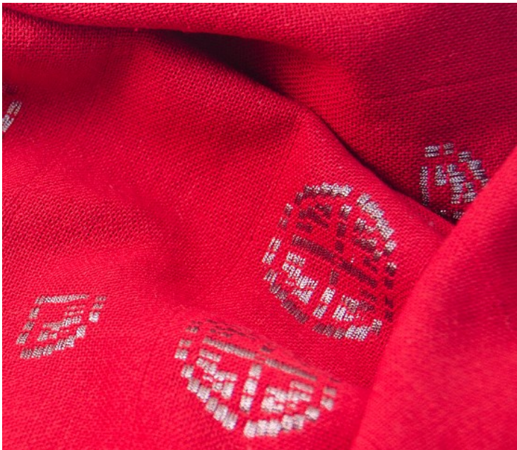
Detail of Pieces of Eight and Two-Bits scarf by Sandra Hutton woven on 32 shafts. There is an 8-shaft doubleweave base in 60/40 silk/wool and three 8-shaft supplemental warp groups of fine silver rayon polyester cord for the coins and quarters.

The book emphasizes the design process and will contain work from over 70 CW members. There will be design and/or technique tips from the weavers and editors for each piece. An extensive reference section will point the weaver to additional resources for many of the pieces.