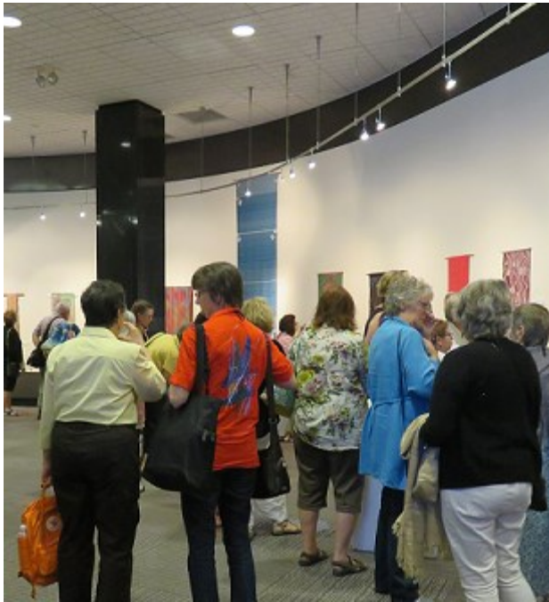
The Complexity 2018 reception hosted many guests, shown here enjoying the art.