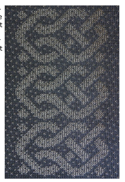
CW—Ties That Bind panel (turned sideways) by Lynn Smetko