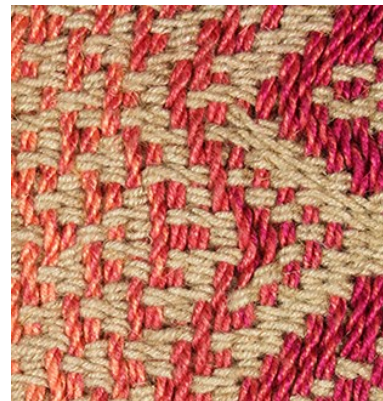
Barbara Walker, "Ode to Wanda"—Basket from ply-splitting an 8-shaft undulating twill pattern

To give you a taste of what is to come, here are three photos: