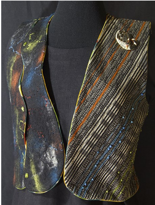
Leslie Killeen, "Night Reflections"—8-shaft vest with felting and beading

Now the team begins the hard tasks of making final selections for the book, editing, layout, etc. We hope to have all ready by Seminars 2018 , with an exhibit of pieces at Seminars. We send our thanks and cheers to all who submitted!